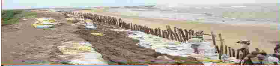
RAJNAGAR-GOPALPUR RETARD EMBANKMENT AT PENTHA UNDER