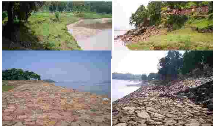
WORK IN PROGRESS ON MAHANADI RIGHT NEAR KANTILO