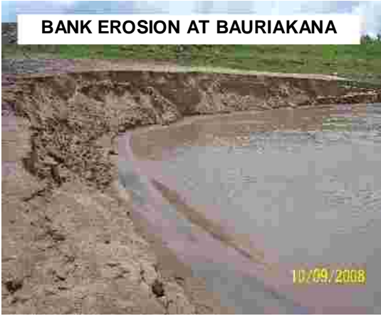
BANK EROSION AT BAURIAKANA