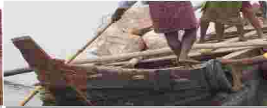
POST FLOOD OBSERVATION AT GOPALPUR-TITHAPADA