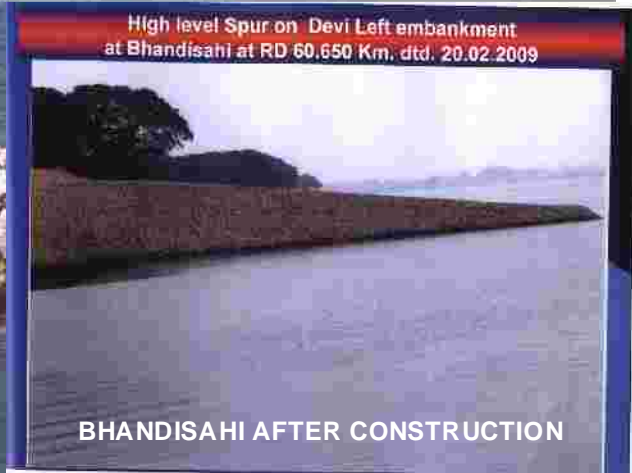
High level Spur on Devi Left embankment at Bhandisahi at RD 60.650 Km. dtd. 20.02.2009