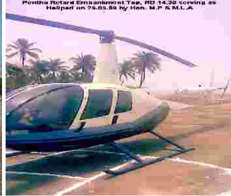
Pentha Retard Embankment Temp. RD 14.30 serving as Helipad on 26.03.09 by Hon. M.P. & M.L.A.