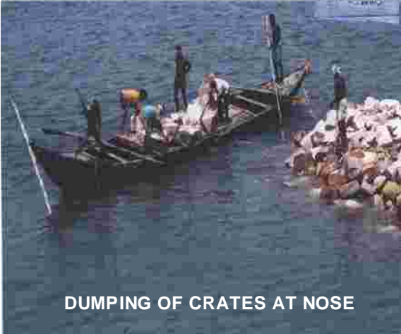
DUMPING OF CRATES AT NOSE