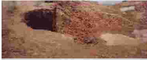
AFTER COMPLETION AT GOPALPUR TITHAPADA