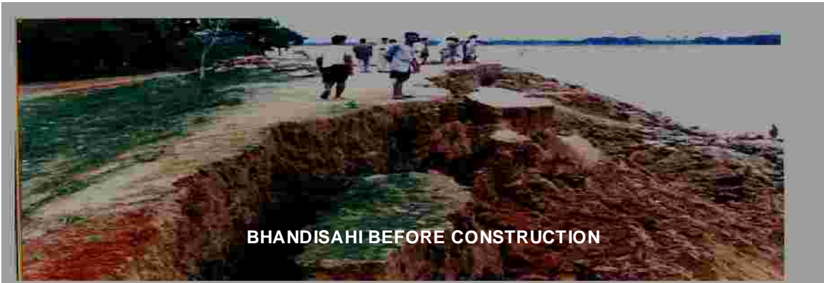
BHANDISAHI BEFORE CONSTRUCTION